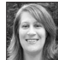
Marlo Schulz Urban Scholastic Center