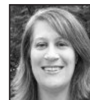
Marlo Schulz Urban Scholastic Center